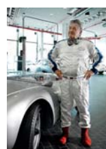
Hans Herrmann (81, legendary racing driver)