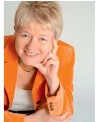
Ilona Kickbusch , Chairperson of the World Ageing & Generations Congress 2009

These are but a few of the intricate and highly relevant questions to be addressed at the WORLD AGEING & GENERATIONS CONGRESS 2009 , which is aimed at a broad audience interested in a comprehensive examination of the effects and consequences of the ever-increasing global population and a continuously ageing society. The congress is therefore as much an educational as a mind-shifting event – an international and interdisciplinary platform used by decision-makers from all spheres of society and by a general audience that is fascinated, intrigued, and concerned about the consequences of global demographic shifts.